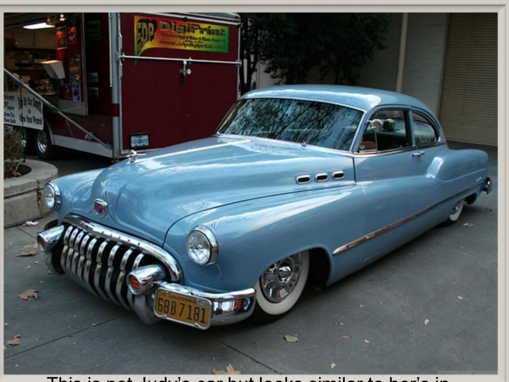
This is not Judy's car but looks similar to her's in