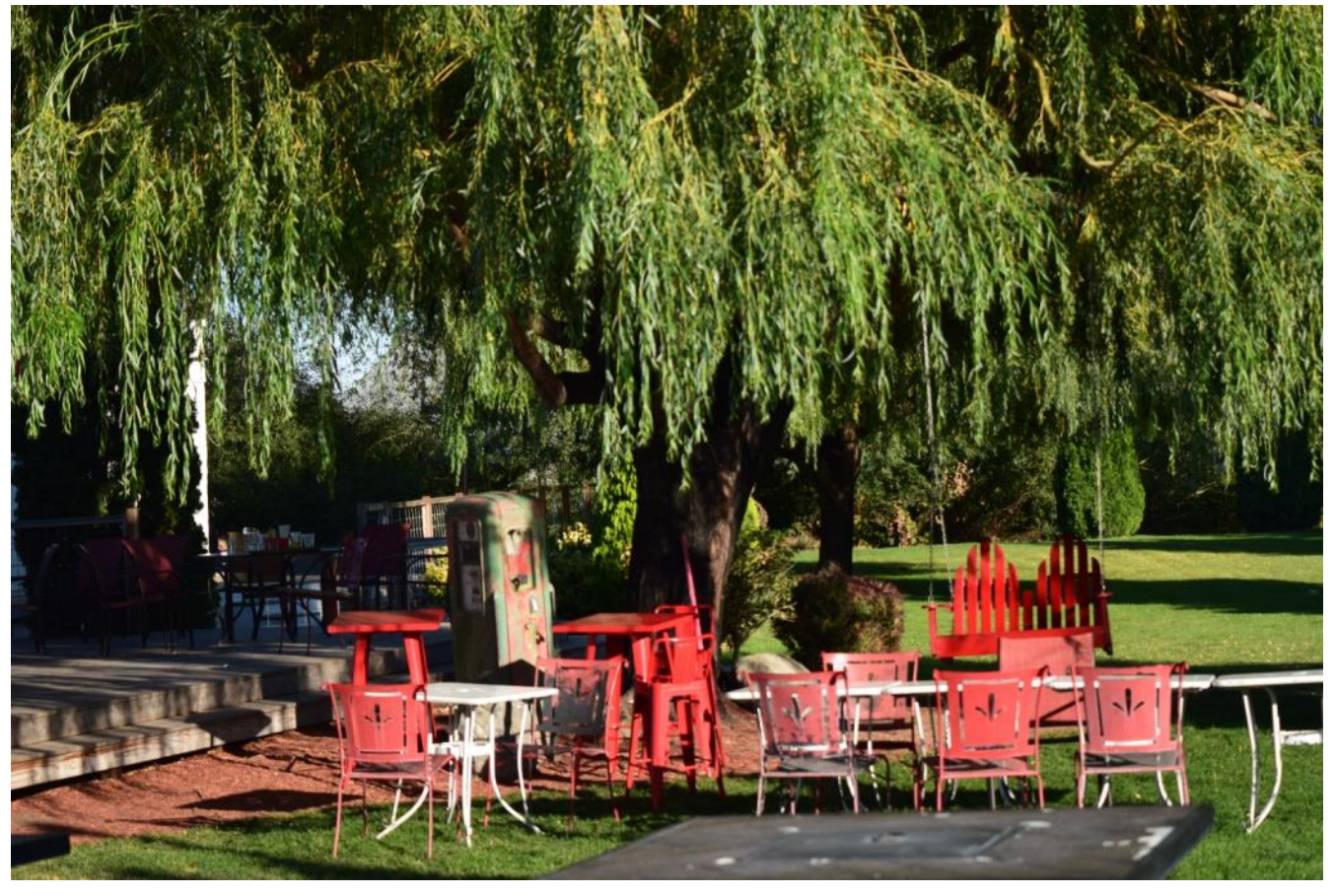
The only thing missing is you!

<u>What to Bring</u>: Your car-club friends, family and lawn chairs. Join us for a day of relaxation and getting to know friends from other clubs in SW Washington and NW Oregon.