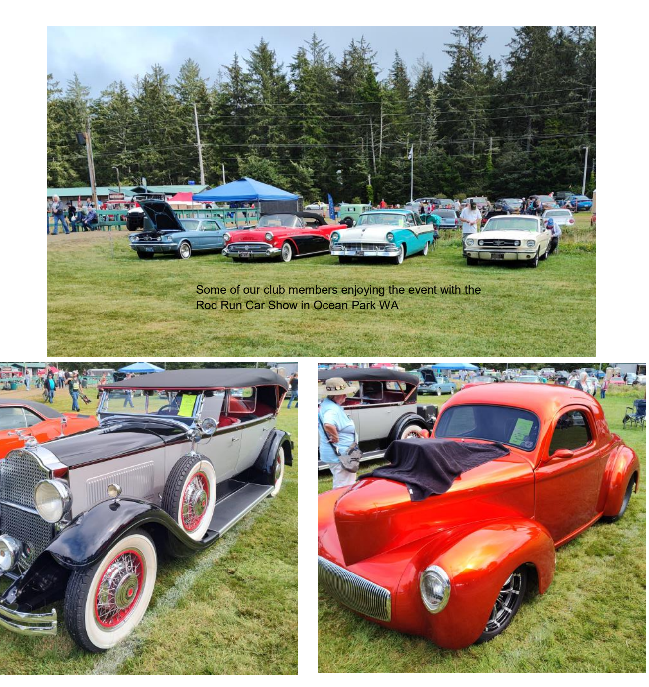
Two of the big winners at the 2024 Rod Run

(ps: send in pictures of your fun times to The Backfire Editor and see them posted here to share with everyone!)